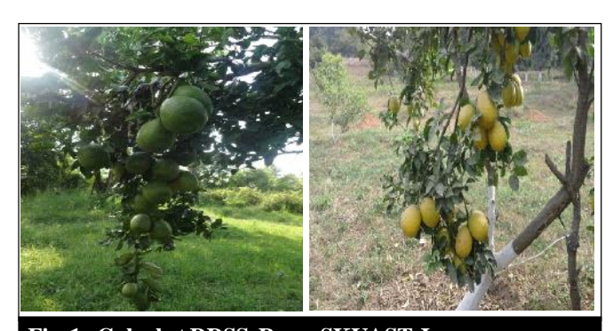
Fig. 1: Galgal at RRSS, Raya, SKUAST-Jammu

3.2 m, with an irregular and loose crown and a trunk 5.9 cm in diameter. Green and smooth bark, numerous, stout, thorns upto 2.0 cm log; petioles; petioles 1.9 cm long and 0.3cm wide, marginally winged, distinctly articulated; leaflets broadly elliptic-ovate to oblong, 12.5 cm, crenate, base cunceate-rounded; flowers in clusters of 8, seldom solitary, terminal or axillary, mildly fragrant. Fruits ovateoblong, ground colour green, mature stage yellow, average fruit weight 530 g, total number of fruits: 110, Fruit length: 11.2 cm, width 7.2cm, Average number of seeds: 18, Seed length: 1.1 cm, Juice content: 160 ml, Fruit ground colour: green, Pulp weight: 240 g, Peel weight: 180 g, Fruit maturity: last week of October, Peel thickness: 1.3cm, Apex: slightly nipple, rind: 0.6 cm thick, strongly adhering, segments:8, pulp: light yellow, coarse, vesicles cylindrical, loosely packed, light yellow, conical ovate with prominent ridges and smooth surface.